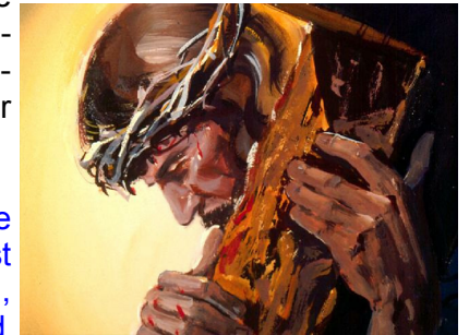
Jesus was willing to give all for us – even His life.

Here Jesus compares the two ways of life. Even to own the whole world cannot save us for eternity. If we lose everlasting life, we have lost everything. Our life in this world will terminate all too soon. Of what value is our treasure then?