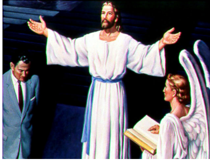
Our prayers are heard because Jesus intercedes for us.

If we have faith that God will heal, God will raise the sick to health in response to the earnest prayer of the believer. In fact, a devoted prayer life will encourage us to bring all things to our heavenly Father. He will be to us a constant Companion, leading us day by day in the paths of righteousness.