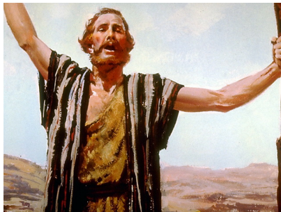
Prophets called people to repentance and gave them messages from God.

The Christian church has been given the gifts of the Spirit in order that it might progress. Through these gifts God seeks to mould the character of His people that they might grow spiritually. Notice one of these gifts is the gift of prophecy. By this verse we expect to see it in the Christian church.