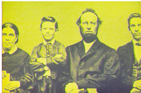
The White Family

In 1904 she wrote, “Soon great trouble will arise among the nations ... trouble that will not cease until Jesus comes.”