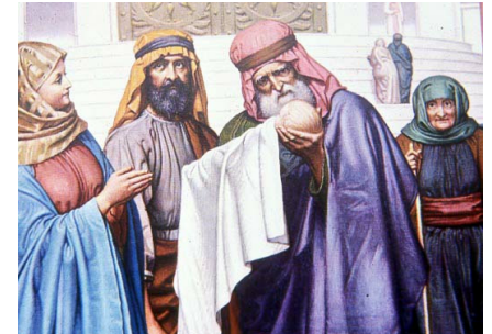
Anna the Prophetess was present at Jesus' birth.

The purpose of the prophet was to guide and direct God's people, and to call them to repentance. It is interesting that not all prophets made future predictions, yet this is what many feel is the distinguishing mark of a prophet. Samuel, Ezra and John the Baptist made no predictions of the future. Not all prophets wrote portions of the Bible either; for instance, Elijah and Elisha. The chief work of a prophet was to speak on God's behalf; to be His mouth-piece.