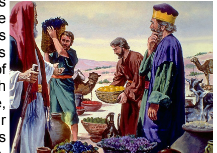
Abraham bringing tithes to the King of Salem.

Although all belongs to God, He does not require us to return all – just the tithe or 10%. When we examine His plan; God is most generous. He does most of the work, and we get most of the pay. A good partnership, if such were a business deal. To return tithe, simply means giving God 10% of our increase. If wages are $100 the tithe is $10. In the case of a businessman, tithe is deducted after expenses incurred in his business have been accounted for. For e.g. if his profit is $1,000 – expenses for materials, wages, rent, power etc. come to $400. Increase is $600 therefore tithe is $60.