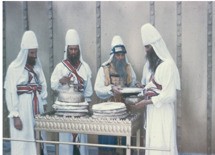
Tithe was used to support the priests attending to the Sanctuary service.

The Levites possessed little or no land, ran no businesses, and did not work for wages. They were the ministers of the people and worked for God in caring for the temple and its services. God regarded this phase of Israel’s life as most important, and the Levites were to do this work on a full time basis. Their income was derived from the tithe, given by the other eleven tribes.