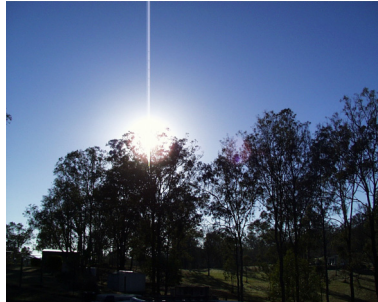
We need several minutes a day of Sunshine

_____, who is in you, whom you have received from God? You are not your own; you were bought at a price. Therefore honor God with your body.