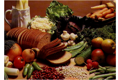
Plenty of Fresh fruit and Vegetables

Genesis 1:29 Then God said, “I give you every seed-bearing plant on the face of the whole earth and every tree that has fruit with seed in it. _____.”