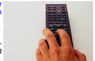
At the push of a button, anyone can access volumes of sex, violence and immorality – all fatal to spiritual growth.

Philippians 4:8 Finally, brothers, whatever is true, whatever is noble, whatever is right, whatever is pure, whatever is lovely, whatever is admirable—_____