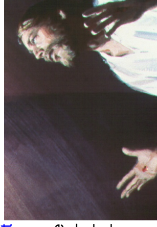
Daniel struggles to fully comprehend the vision but is unable. Before Gabriel finishes the explanation – Daniel faints and the explanation must be continued later in Daniel 9.

In this prophecy concerning Israel, God used one day to represent one year. Numbers 14:34 uses the same principle. The day-for-a-year principle is also applied to this prophecy of Daniel. There is no doubt, when we see the accuracy of its fulfillment. Therefore, the 2,300 days = 2,300 years, and the 70 weeks = 490 years – the 490 years being the first part of the 2,300 years.