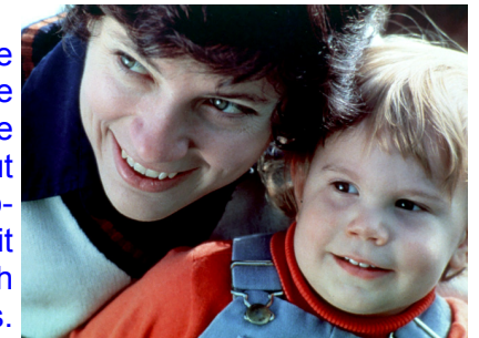
A day set aside to strengthen family relationships

Jeremiah 17:24,25 But if you are careful to obey me, declares the LORD, and bring no load through the gates of this city on the Sabbath, but keep the Sabbath day holy by not doing any work on it, then kings who sit on David's throne will come through the gates of this city with their officials. They and their officials will come riding in chariots and on horses, accompanied by the men of Judah and those living in Jerusalem, and this city will be inhabited forever.