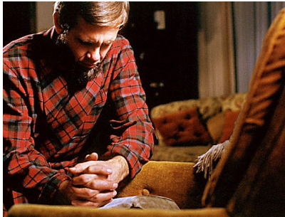
Sabbath offers us the opportunity for more time in prayer talking to our Father in heaven

When God's call: "Take your foot off My Sabbath" first comes to us, we naturally ask: How does God want us to keep the Sabbath? In what way should our conduct on this day differ from our conduct on the other days of the week?