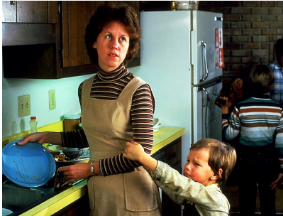
The Sabbath offers us a day with less responsibilities in the kitchen

Save whatever is left and keep it until morning.'" "Eat it today," Moses said, "because today is a Sabbath to the LORD. You will not find any of it on the ground today. Six days you are to gather it, but on the seventh day, the Sabbath, there will not be any." Nevertheless, some of the people went out on the seventh day to gather it, but they found none. Then the LORD said to Moses, "How long will you refuse to keep my commands and my instructions?"