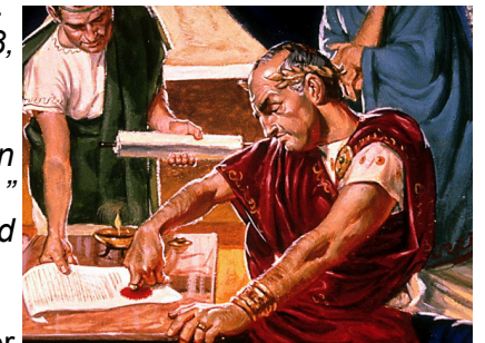
Constantine's Famous Sunday Law of A.D. 321

“Sunday is recognised as a human ordinance, not a divine command.” The History of Christian Religion and Church , page 186.