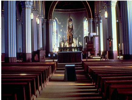
The Roman Church Capitalised on Constantine's Law and pressed it further

"It was the Catholic church which, by the authority of Jesus Christ, has transferred this rest to Sunday in remembrance of the resurrection of our Lord. Thus the observance of Sunday by the Protestants is an homage they pay, in spite of themselves, to the authority of the Catholic church".