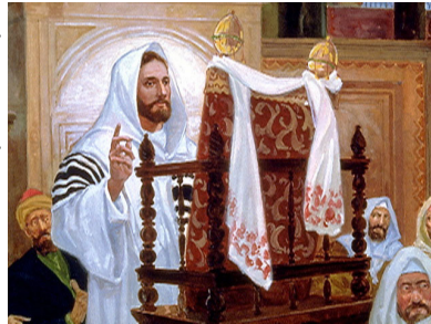
Jesus taught and believed in creation.

Some feel that the carbon-14 method of measuring the age of fossils etc. is most accurate. In some cases this is so, but it has not been reliable in a number of instances. One example of this is when a living mollusc was tested by carbon-14, and found to be dead for 3000 years. “Creation Research Society Journal” . Obviously the Carbon-14 method was wrong in this case. It is generally conceded that it takes millions of years to produce oil in the earth, but scientists working in a laboratory produced a barrel of oil from one ton of garbage in 20 minutes. “Machine Design”. Many things, assumed to take millions of years, could have been done in a relatively short time. When scientists mention millions of years, they are only guessing.