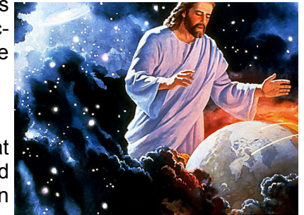
We are made by design, not by chance.

There is another form of evolution called, “Theistic Evolution,” which tries to marry the Bible story of creation with modern evolution. The thought being that God created original matter, and life has continued to evolve. It is impossible to believe this theory and the Bible too, as they are in conflict. The Bible story is that God created all things in perfection; there is no room for progressive evolution.