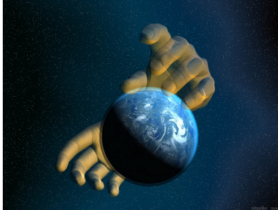
In the beginning God created the heavens and the earth.

Here is the noble origin of mankind – created in the image of God – made from the dust of the ground.