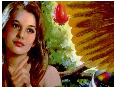
Adam & Eve were tempted to believe that they were immortal

Genesis 2:16,17 And the LORD God commanded the man, “You are free to eat from any tree in the garden; but you must not eat from the tree of the knowledge of good and evil, for when you eat of it you will surely die.”