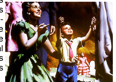
The righteous who have died shall be raised from the dead to receive eternal life

Some are concerned for those who have died in some terrible way, and the body has been mangled or eaten by wild animals, or some other tragic thing has happened. There is no need to be concerned. God promises in 1 Corinthians 15 to give us a new incorruptible body. We will not possess the same atoms of flesh we now have. In the meantime, God preserves our individual personality and character, then just as He created Adam, so He will re-create us – perfect – to live forever.