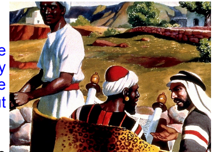
Phillip studying with the Ethiopian Eunuch.

It is not our intellectual greatness that helps us to understand the things of God. In fact many of the world's intellects scoff at the Bi-