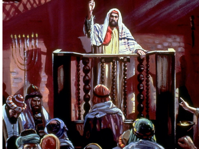
Paul commended the Bereans for searching the Bible every day.

How should we interpret the Bible? Compare Scripture with Scripture. The Bible is not written in subject form. For example, the second coming of Christ is mentioned in many different books of the Bible. If we want to know what the Bible teaches on this subject, the texts are brought together so that we can see the complete pic-