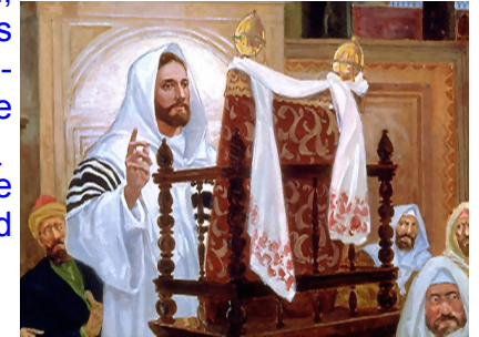
Jesus had total confidence in the scripture

Luke 24:44,45 He said to them, "This is what I told you while I was still with you: Everything must be fulfilled that is written about me in the _____ Then he opened their minds so they could understand the Scriptures.