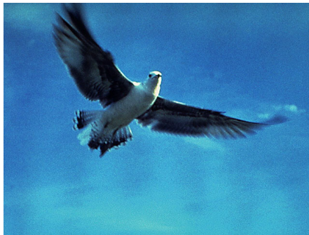
We need the guidance of the Holy Spirit to understand the Bible.

John 7:17 If anyone chooses to do God's will, he will find out whether my teaching comes from God or whether I speak on my own.