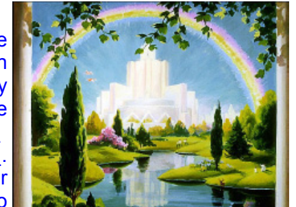
The Third Heaven – where God dwells.

_____. And if I go and prepare a place for you, I will come back and take you to be with me that you also may be where I am.