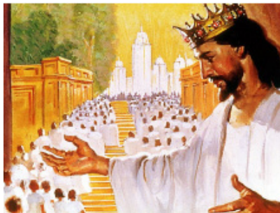
We shall see His face.

There will be no need of tears, for there will be no more death, sorrow, crying or pain. Life as we know it now, will be banished forever. Neither will there be any disease or suffering "The eyes of the blind will be opened—the ears of the deaf shall be unstopped—the lame shall leap like a deer and the tongue of the dumb sing." Isaiah 35:5,6. Imagine a world of perfection and such happiness. This is what God is preparing for believers. A place where the desert will blossom as a rose, Isaiah 35:1, and the inhabitant will not say, "I am sick." Isaiah 33:24, and violence will cease, Isaiah 60:18. In God's land there is fullness of joy and pleasures forevermore. Psalm 16:11.