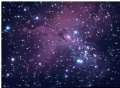
The Second Heaven – the realm of the sun, moon, stars.

2 Corinthians 12:4 . . . was caught up to paradise. He heard inexpressible things, things that man is not permitted to tell.