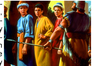
Daniel and friends in Babylon

These ancient people of God have mingled with all nations for over 2,500 years, yet they have always maintained their racial identity. During this same time many other nations have arisen, remained distinct for a while, and then disappeared in the mass of humankind. But the Jews are found in every nation, as the prophecy said they would be, but always and everywhere they are distinct.